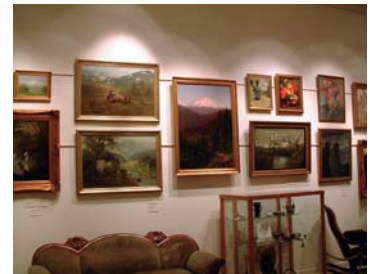
Shasta Courthouse Museum

Lighting for performance venues demands careful consideration of the artists' requirements, in context with house lighting and overall project budget. ArcSine's knowledge of the performance requirements; as well as lighting control systems and their costs and capabilities, results in effective solutions.