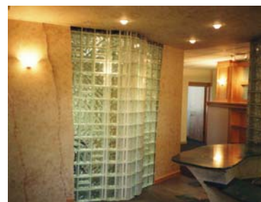
P&M Cedar Products, Corporate Headquarters